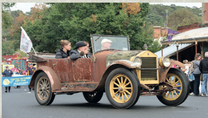
The King’s Birthday Swap Meet.