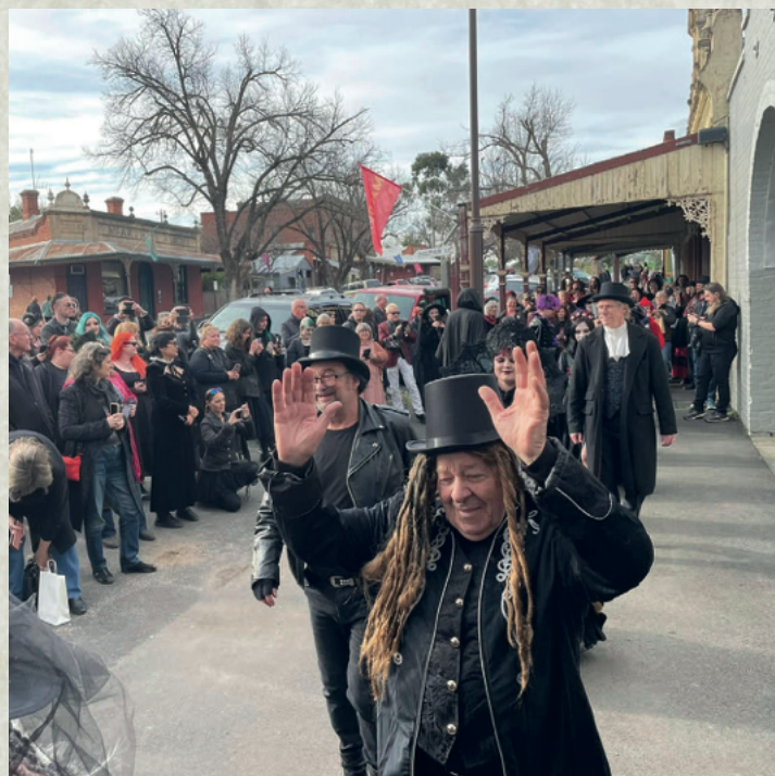
The Goldfield Gothic Festival.