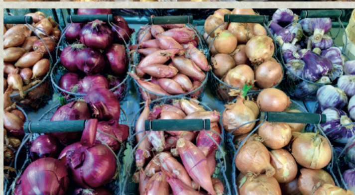
The Maldon Market Day.